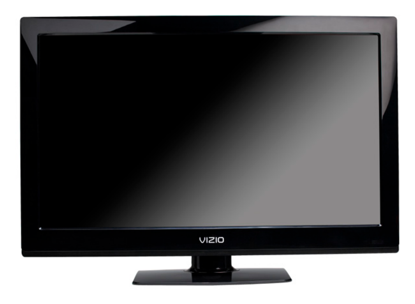
VIZIO LCD HDTV with Base